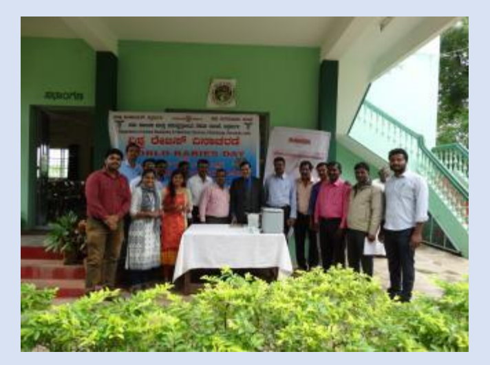
Government of Karnataka, Department Of Animal Husbandry And Veterinary Services And Karnataka Veterinary Association.

On 25th and 26th Sept free rabies vaccination at Chitra Durga was organized. Policy makers at the district, municipality, health, Veterinary, and district environment engineer, were all present under one banner. 180 dogs were vaccinated.